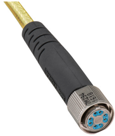
Octax®-Solo Adapter Cable Assembly