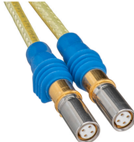
Octax®-Solo Adapter Cable Quadrax Contact